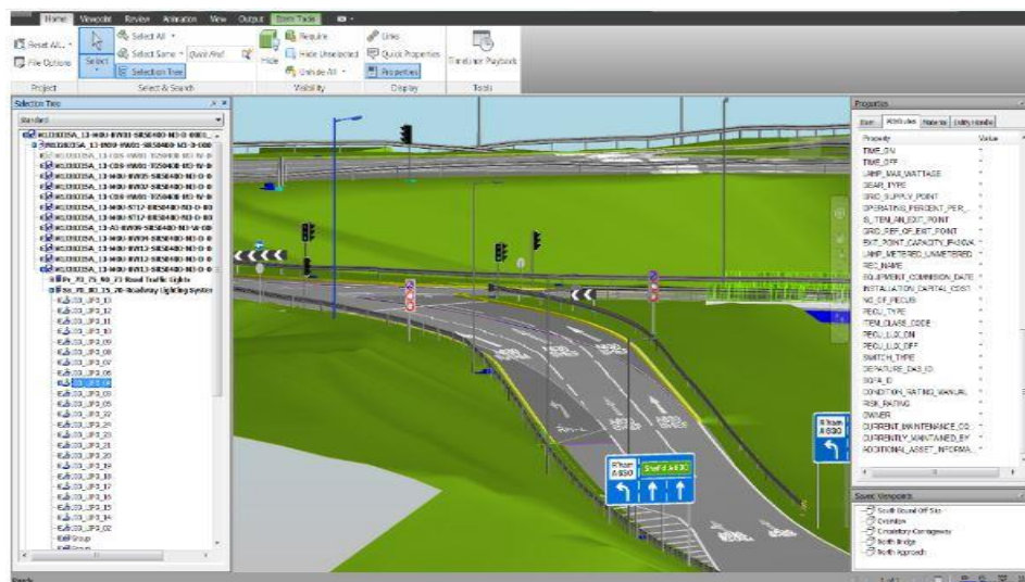
Figure 2: Screenshot of the M1J33 BIM Model (Mouchel Consulting,2015)

January – April 2014. The project team worked with the management team and supply chain through collaborative monthly workshops, to develop the model which contains detailed design and contractual information, existing management asset data, pavement data, as-built information and the contents of the Health and Safety File. Good collaborative relationships were maintained throughout the development and construction phases of the project between all parties. This led on to a smooth handover of the scheme into maintenance, due in part to the development of the BIM model. The model is now being used as an asset maintenance tool for the first time in the country. Important lessons learned include; (i) current HE databases are very high level and do not capture the granularity of data available, as required by the maintainers, (ii) further work is needed to capture all stakeholder requirements, so that a comprehensive recording system can be developed, which will enable maintainers and stakeholders to better interrogate and use captured data.