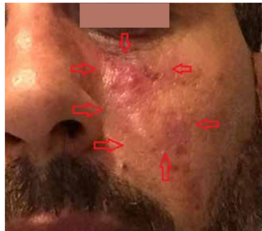
Figure 3. Acute cellulitic infection after hyaluronic acid filler application to nasolabial fold (38 year-old male patient).

Among all patients, only 12 patients experienced HA filler-related complications, corresponding to 9.75% of all patients receiving HA filler application. The incidence of each type of complication is as follows: vascular complications 1.62%, cellulitic infections 1.62%,