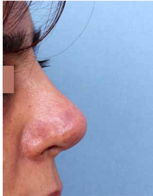
Figure 2. Livedo reticularis on nasal tip after hyaluronic acid filler application to nasal tip (47 year-old female patient).

Infraorbital edema in two patients and granulomas in three patients were completely treated in 7 to 12 days with the use of hyaluronidase (20 to 30 U, single application).