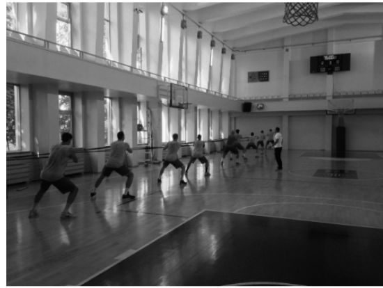
Figure 3. Stance position with upper body rotation