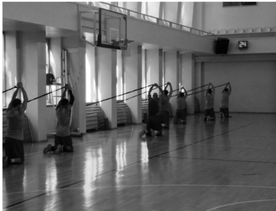
Figure 1. Kneeling position with shoulder rise

Lat: lateral; Ext: extension; Rep: repetition; min; minute; Abd: abdominal