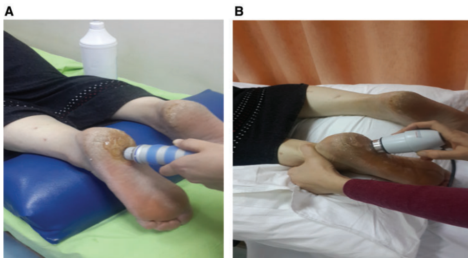
Figure 2 Application of the treatment modalities. A) Radial extracorporeal shock wave therapy application. B) Ultrasound application.

500 pulses, 3 Hz, 0.2 mJ/mm 2 applied to the whole heel area. Then, a dose of 1,500 pulses, 8 Hz, 0.3 mJ/mm 2 was applied to the specified tender point palpated before the treatment. Thus, a total of 2,000 pulses of r-ESWT treatment was applied in each session. A gel was used to provide conductivity between the probe and the skin during the application. A total of three sessions of r-ESWT treatment were administered once a week [25].